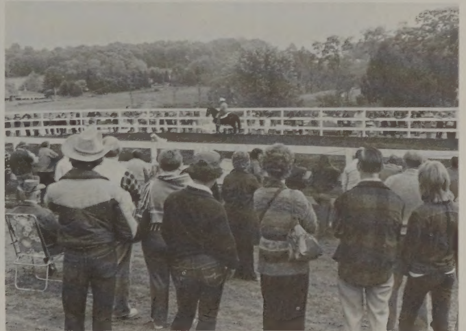
Many adopters return for Wild Horse and Burro Days to demonstrate the versatility of their horses and burros.